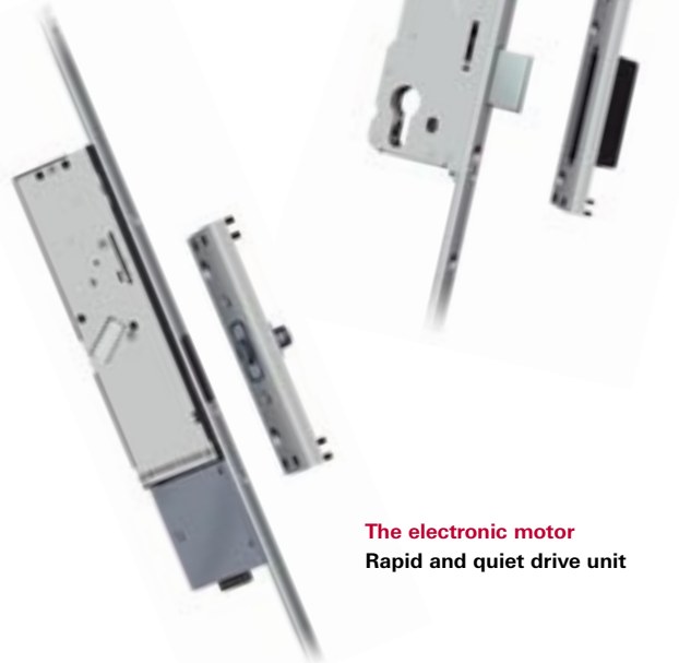
The electronic motor Rapid and quiet drive unit